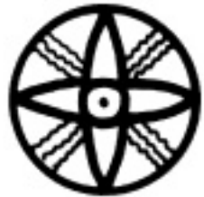
Euphrates-Tigris region (now Iraq)