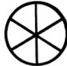
Mohenjo-Daro region (now Pakistan)