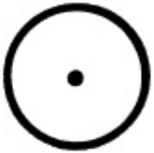
Common sun symbol found in many cultures