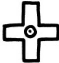
Peru, probably Inca