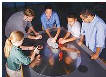
LEARNING FUN: A family at the Museum of Discovery and Science in Fort Lauderdale, Fla., gets acquainted with the "Turntable," spinning metal disks and balls around a central force.

"Motion" is in motion, on its way to the Discovery Science Place. The collection of exhibits allows children to create their own animated movies, see a beach ball float in mid-air, and roll a square wheel.